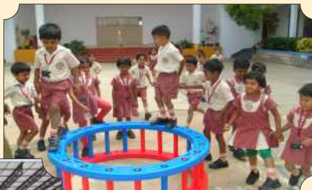
Together we play