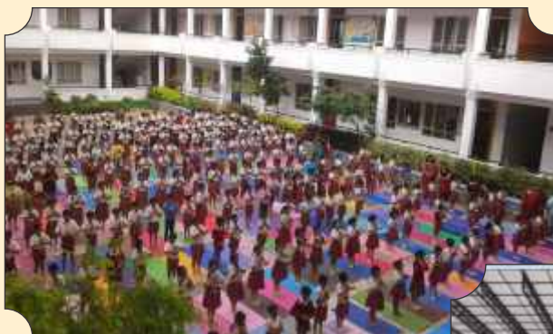
In Sync with Yoga