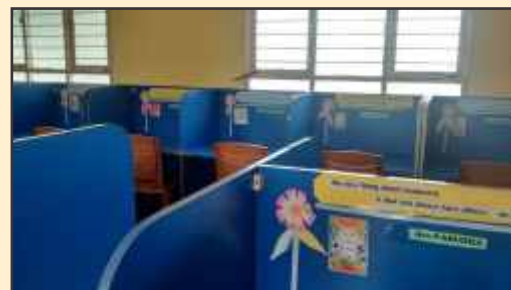
Staff Room Beautified !

The staff room echoed with an excited flurry of voices, all thanks to a very impressive facelift given to all teachers' work station, which charged up the spirits of one and all. We believe that the backbone to any educational institution is a happy group of creative teachers working in a stress free atmosphere and this initiative was a small step in that direction.