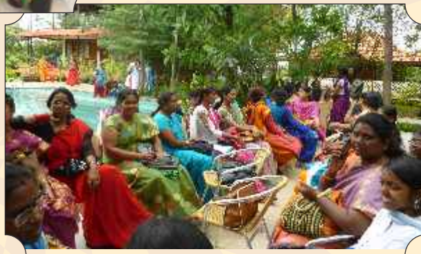
Teachers' Day Out – Discovery Village