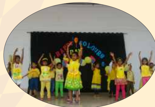
Colours Day - Tiny Tots in Yellow!