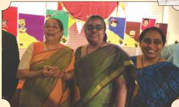
Regency representatives @ Rangashankara